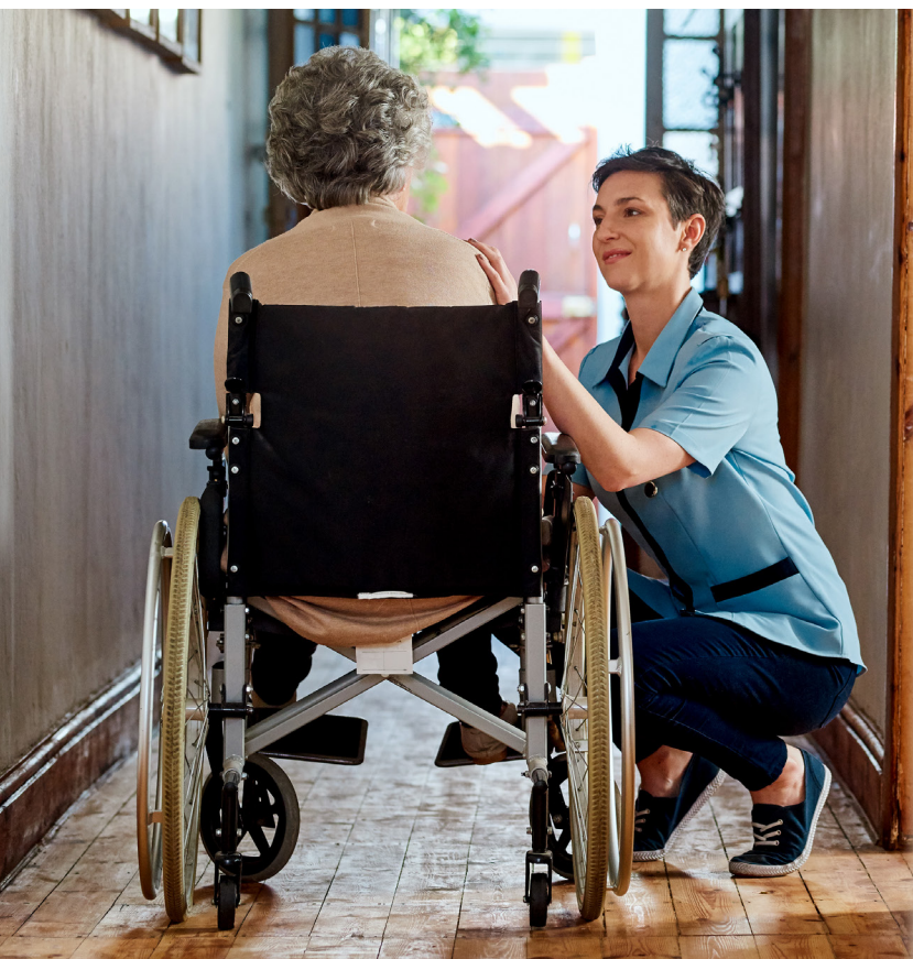
Gender of Caregivers

Research from Fidelity Investments suggests that women tend to invest in a slightly more conservative way than men. 14 Risk aversion — pursuing extremely conservative investments, or not investing at all and merely saving up